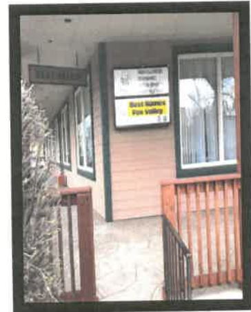
MEDC & Best Homes Fox Valley

Montgomery continues to maintain the look and feel of a quaint small town in spite of the continued growth and unlimited potential. The Village of Montgomery has created a vision for the downtown and encourages development. A new program has begun to create opportunities to utilize the river and enjoy all that Montgomery has to offer. "Montgomery in Motion" plans to build activities around the river and gather neighbors together in a centralized location.